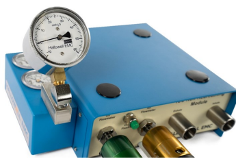
Panel Gauges show Air and O 2 psi from supply hoses.

Converts your Pro Series Anesthesia Ventilator into an ICU Respirator and mounts conveniently under the vent. This unit was produced during COVID pandemic research and development and is a game changer for ICU care! A must-have for every facility that uses an HEMC Pro series Model Ventilator.