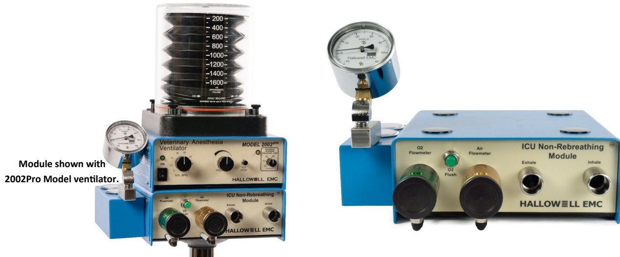
Module shown with 2002Pro Model ventilator.

Converts your Pro Series Anesthesia Ventilator into an ICU Respirator and mounts conveniently under the vent. This unit was produced during COVID pandemic research and development and is a game changer for ICU care! A must-have for every facility that uses an HEMC Pro series Model Ventilator.